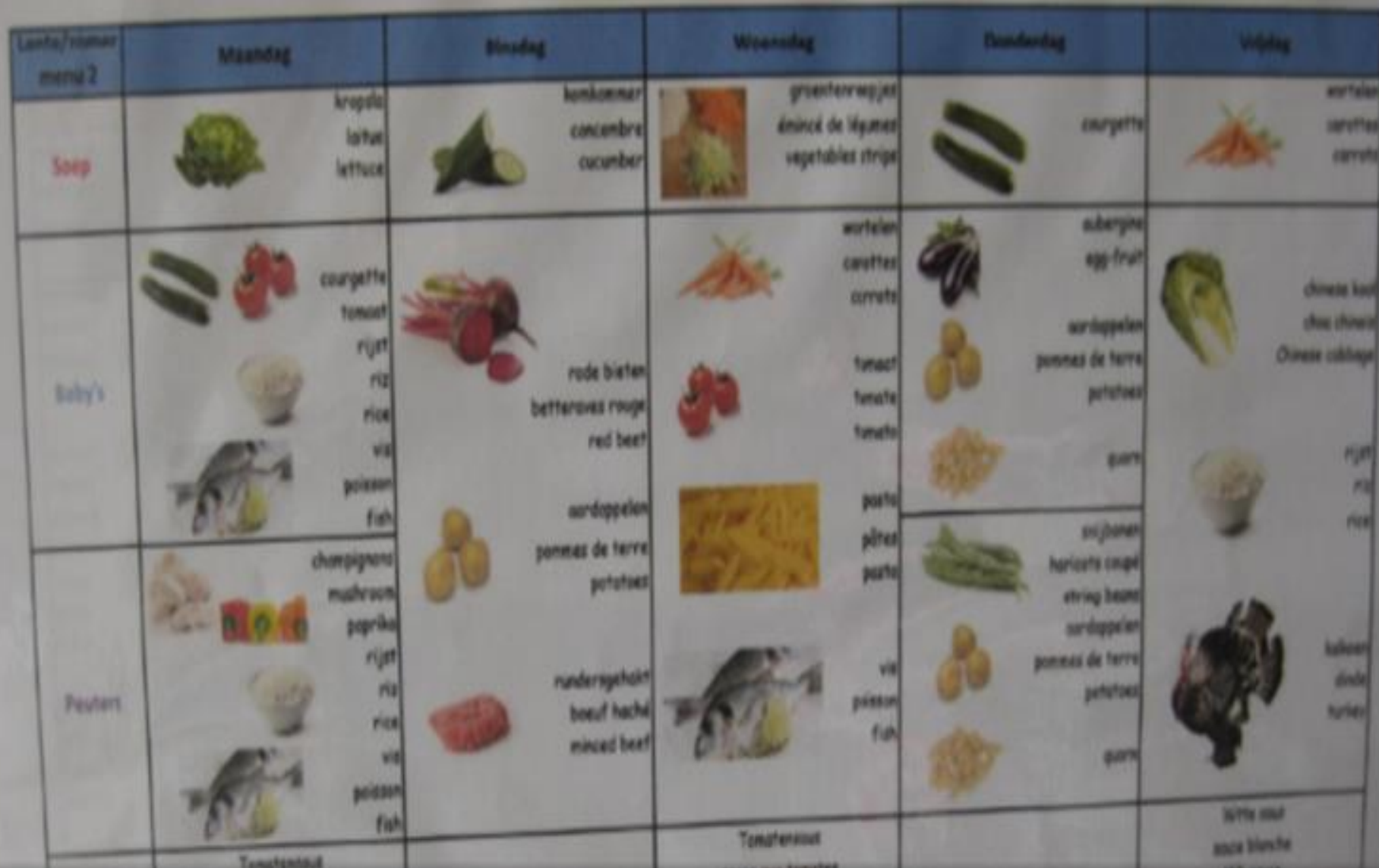
A MULTILINGUAL MENU FOR A MULTILINGUAL AND MULTICULTURAL SETTING